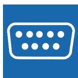
RS232 (optional instead of RS485)