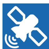
GPS Glonass (optional)