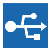
USB 2.0 (optional)