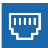
10/100 MBit/s Ethernet