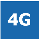
2x 4G LTE