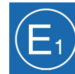
E1 approval (optional)